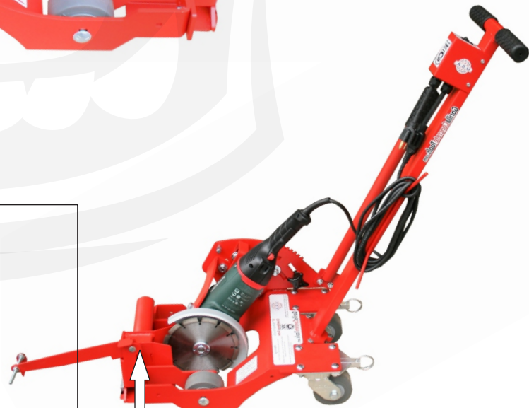
Optional crack chasing guard